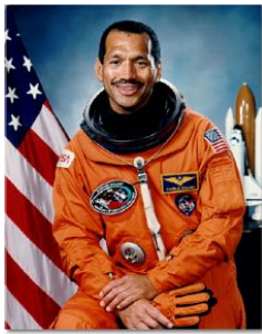
Major General, USMC Retired Charles F. Bolden, Jr.

Born on August 19, 1946 in Columbia, South Carolina, Charles Bolden graduated from the U.S. Naval Academy in 1968. Designated a naval aviator in May 1970, he flew more than 100 combat missions in South Asia in the early 1970's. Throughout his career, he has logged more than 7,000 flying hours in over 30 different fixed and rotary wing aircraft. Bolden was selected by NASA as an astronaut in 1980. It was at NASA that Bolden earned his shuttle flight wings by flying four missions aboard the space shuttles Columbia, Discovery and Atlantis. Over the course of these four space flights, Bolden logged more than 680 hours in orbit, assisted in deploying the Hubble Space Telescope, and commanded the first mission that included a Russian cosmonaut as a mission specialist crew member.